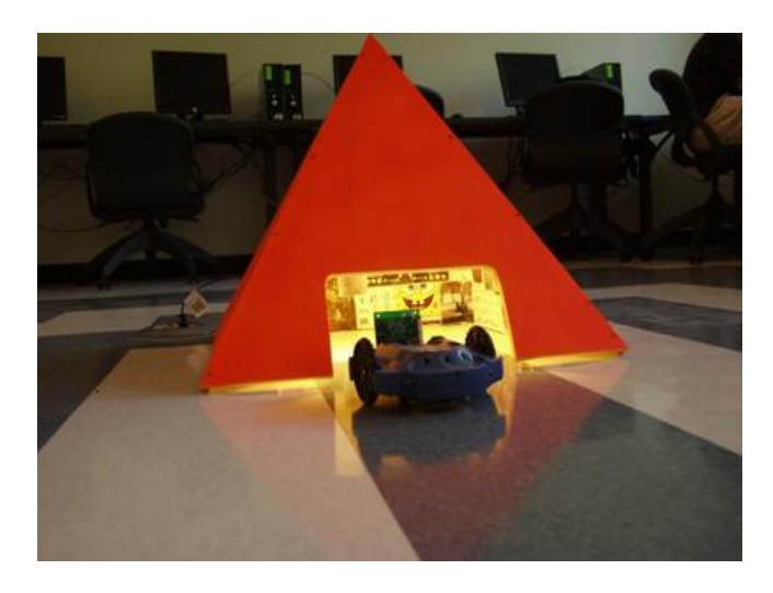
Figure 2: For one of the assignments, students program the Scribbler to make its way into the pyramid, photograph the walls, and then exit.

of CS1 courses: at Bryn Mawr College in spring and fall 2007 with 60 students (nearly all women), at Georgia Tech in spring, summer, and fall 2007 with over 200 students.