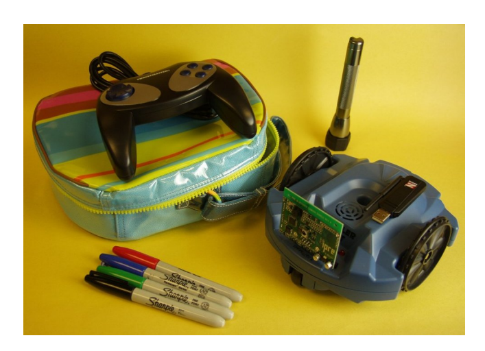
Figure 1: The IPRE Robot Kit, Fall 2007. Clockwise, from top-left: lunchbox carrying case, gamepad, flashlight, Scribbler robot with IPRE Fluke (camera and serial Bluetooth adaptor), USB Bluetooth dongle (for computer if it doesn't have Bluetooth), and drawing pens.