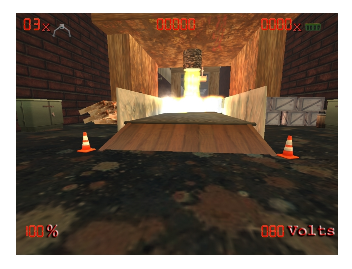
Figure 4: Student game - Otis: screen shot