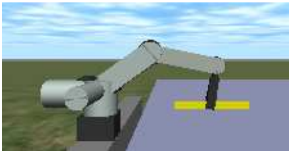
Figure 1: The simulated CRS+ A251 manipulator used in the experiments holding a stick object.

The robot is a simulated model of a CRS+ A251 manipulator arm (see Figure 1). The robot has 5 degrees of freedom (waist translate, waist roll, shoulder pitch, elbow pitch, wrist pitch, wrist roll) plus a gripper. A simulated camera is mounted above the robot's working area. Vision routines are simulated by reading the positions of the objects from the internal data structures of the simulator.