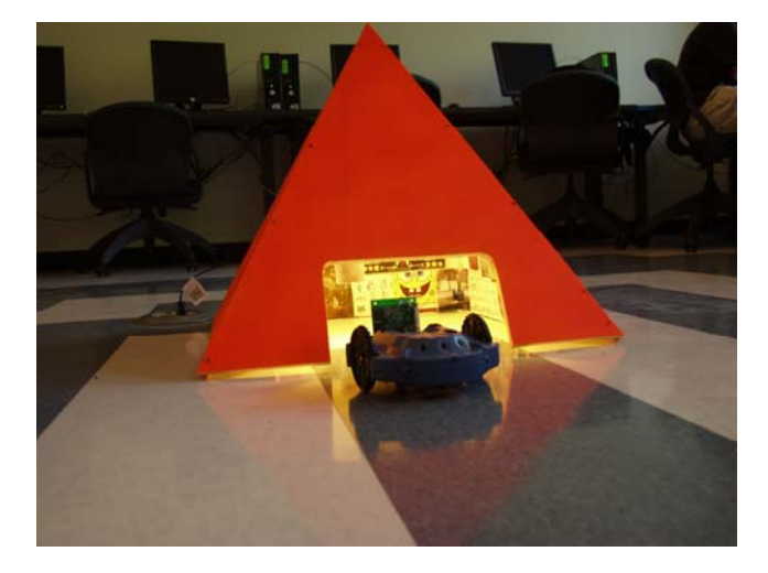
Figure 3. Exploring a pyramid exercise.

The chapters on sensing focus on reactive robot control . Students learn the functionalities of various sensors, how to obtain their values, and combined with the if -statements, learn to write several smart robot behaviors. Beginning with a reactive approach is also advocated by Martin (Martin, 2007).