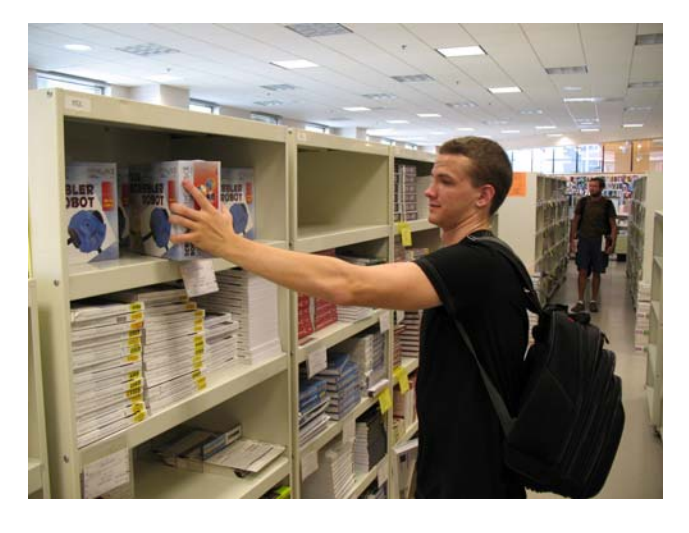
Figure 1. Student Purchasing a Personal Robot

A personal robot Every student gets her/his own personal robot. Our vision is that students registered in a CS1 course taking this approach will go to the bookstore and purchase his/her own personal robot, just like they would purchase a text for the course (See Figure 1). Additionally, since the student owns the robot it can be personalized and used in future classes.