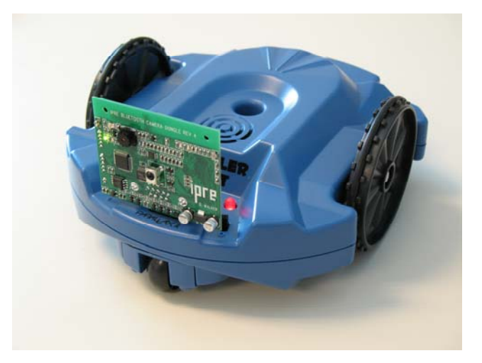
Figure 2. The Scribbler Robot with IPRE Fluke Board

For the pilot offerings of our courses, we have been using the Scribbler robot by Parallax Corp. (www.parallax.com) combined with an add-on board called Fluke, designed by IPRE (See Figure 2). This package costs approximately $110 and has the following features: IR obstacle sensors, three light sensors, IR line sensors, a stall sensor, a color camera, two programmable LEDs, a two-frequency tone